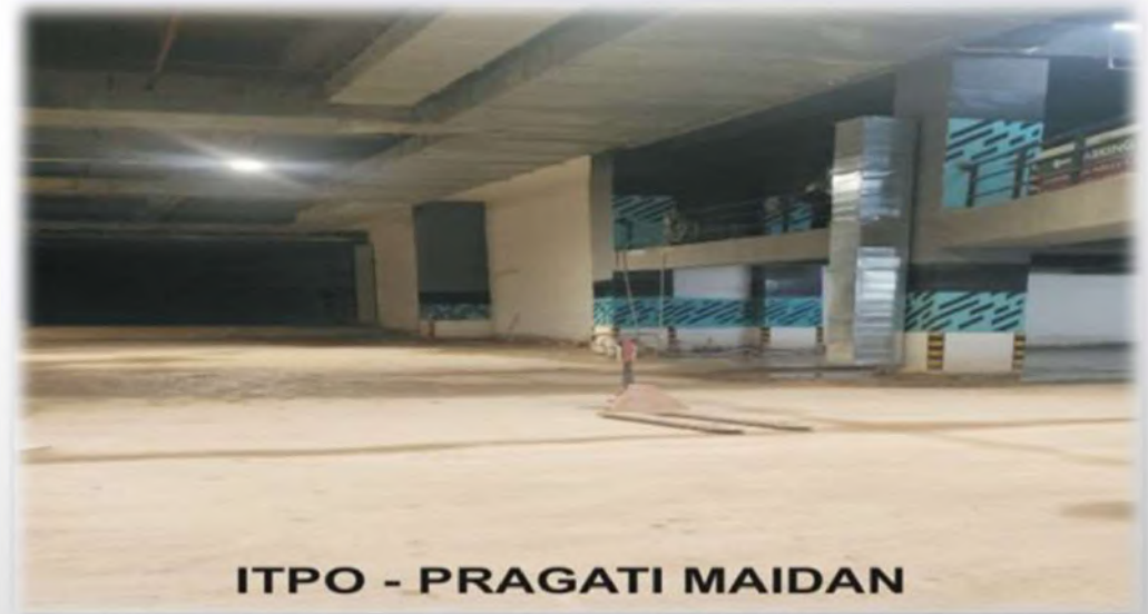
ITPO - PRAGATI MAIDAN