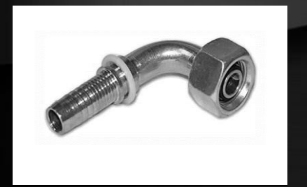
BSP 90° Swept Elbow