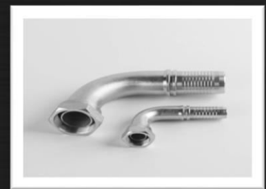
JIC / UNF Straight