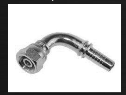
METRIC 90° BEND