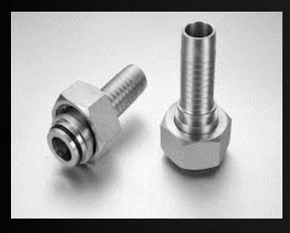
CODE 62 FLNAGE