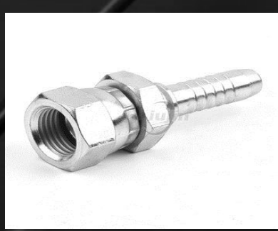
METRIC DIN ST