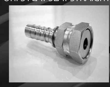
ORFS FLAT SEAT STRAIGHT ORFS FLAT SEAT BEND