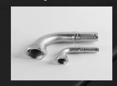
BSP 90° Bend