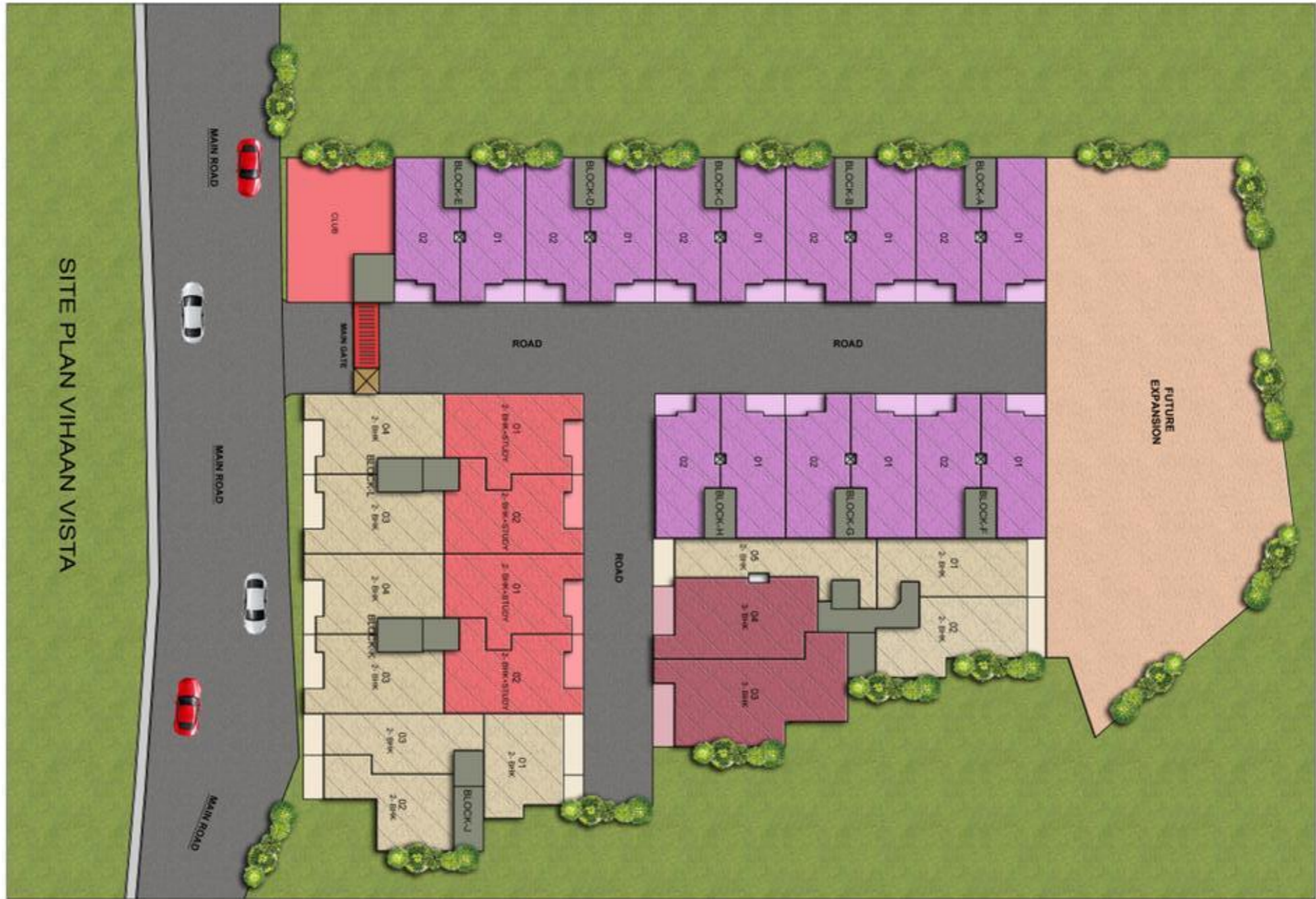
SITE PLAN VIHANN VISTA